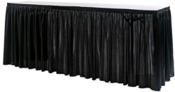
1 - 6' (l) x 24" (w) x 30" (h) Skirted Table - Grey (5004610)

* Order with complete Method of Payment must be received before Discount Deadline date to receive discounted pricing. Orders received after the discount deadline will no longer be package orders and will be placed for each individual item at the regular catalog rates.