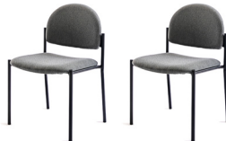
2 - Upholstered Side Chairs (50020)